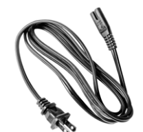
Mains power cable (IEC C7 plug)