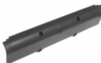
NiMH battery 4.8 V 4.2 Ah