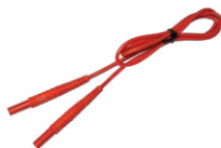
Test lead 1.2 m (banana plugs) red