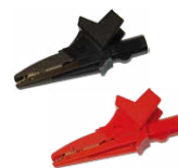
Crocodile clip 1 kV 20 A black / red