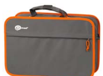
L-2 carrying case