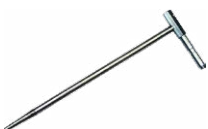
4x earth contact test probe (30 cm)