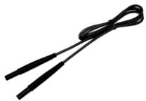
Test lead 2.2 m (banana plugs) black