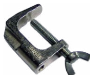
cramp with banana socket