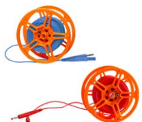
Test lead 25 m for earth resistance measurements (on a reel, banana plugs) blue / red