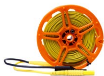
Test lead 50 m for earth resistance measurements (on a reel, banana plugs, shielded) yellow